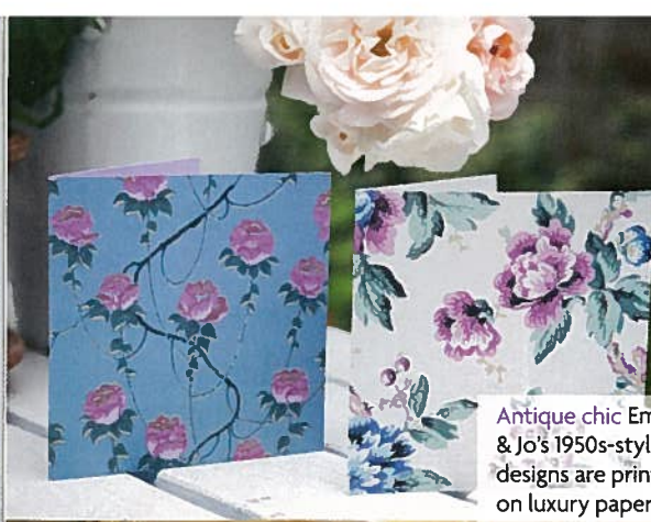
Antique chic Emily & Jo's 1950s-style designs are printed on luxury paper