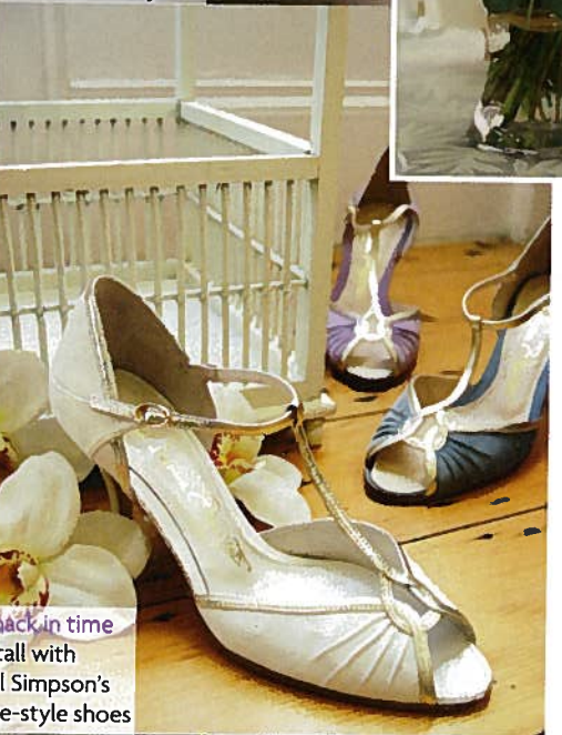
Step back in time Walk tall with Rachel Simpson's vintage-style shoes