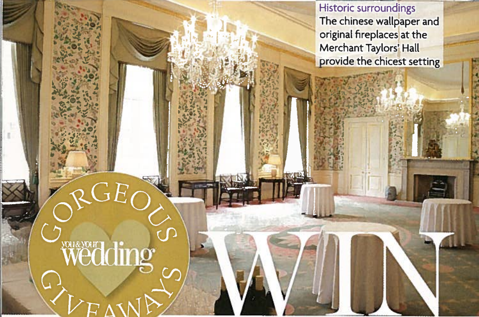
Historic surroundings The chinese wallpaper and original fireplaces at the Merchant Taylors' Hall provide the chicest setting