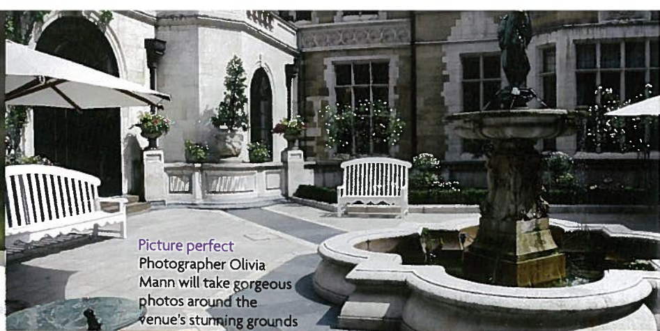
Picture perfect Photographer Olivia Mann will take gorgeous photos around the venue's stunning grounds