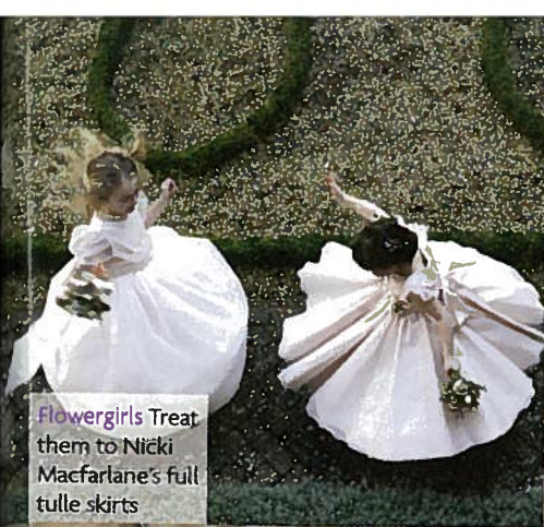
Flowergirls Treat them to Nicki Macfarlane's full tulle skirts