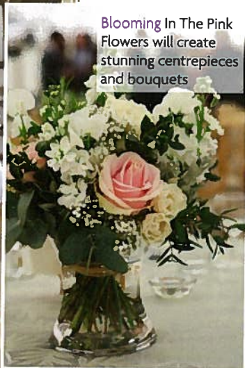
Blooming In The Pink Flowers will create stunning centrepieces and bouquets

The prestigious and exclusive Merchant Taylors' Hall in London's Square Mile will host your wedding when the big day arrives. The spacious mahogany-panelled rooms, antique chandeliers and baby grand piano make it the most magical setting for your big day. Experienced caterers Merchant Taylors' Events ( mtaylorsevents.co.uk ) will provide a fantastic three-course wedding breakfast for up to 50 guests. The perfect complement to your vintage-style day, In The